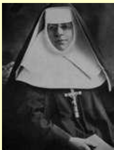
St. Katherine Drexel