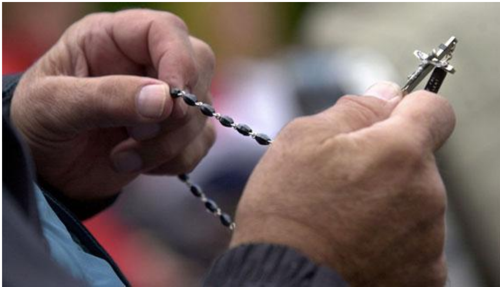
Man praying the Rosary

Catholic conferences and apostolates for men were once few and far between. But in just the last five or six years, the movement has caught fire, with more and more Catholic men being inspired to pray, live lives of virtue and to root out sin in their lives. In short, they want to become the men Christ wants them to be.