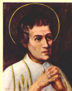
St. Louis de Montfort