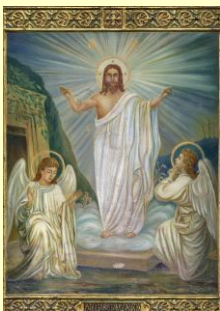
The Resurrection of Our Lord